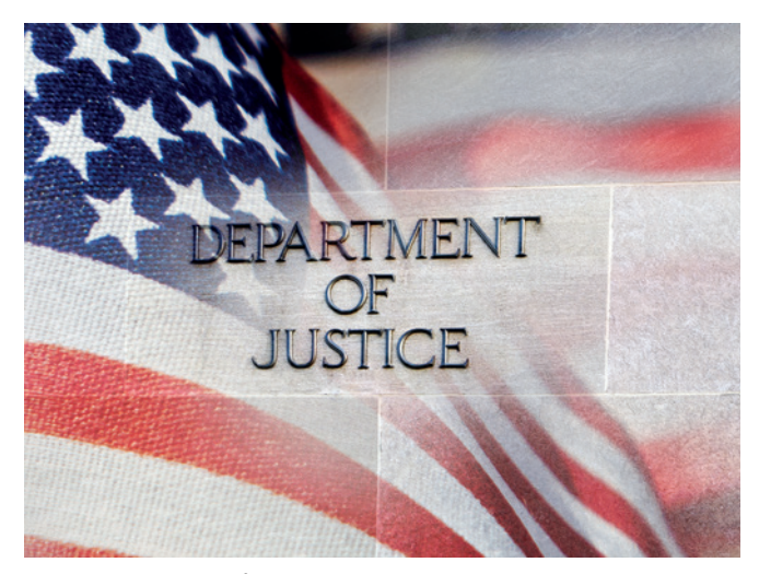
The US Department of Justice, an important mutual legal assistance partner for Switzerland.

Mutual legal assistance in criminal matters plays a decisive role in fighting international corruption, particularly where unlaw-