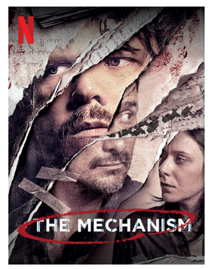
Corruption offences involving the Brazilian construction group Odebrecht were among the cases dramatised in the Brazilian Netflix series 'The Mechanism'.

Various US prosecution authorities have since 2012 been conducting complex investigations into an exceptionally large criminal group in the USA and Venezuela in connection with