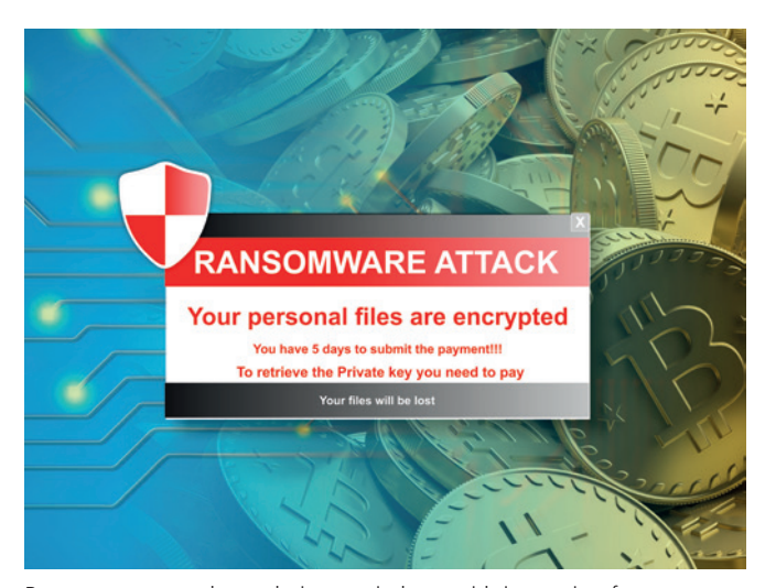
Ransomware attacks are being carried out with increasing frequency. They can cause enormous damage and pose serious challenges to prosecution and mutual legal assistance authorities.

Due to the presence of telecommunications providers on Swiss soil, the number of US requests for mutual legal assistance has increased in recent years. Nowadays requests frequently relate to cybercrime, and must be processed alongside the more conventional requests for mutual legal assistance related to allegations of bribery, fraud and money laundering, which remain complicated and time-consuming to deal with. In particular, secure messaging services are used to commit countless offences, which the DILA is increasingly called upon to deal with as part of its cooperation with the USA. These offences range from extortion, often by hacking attacks using different types of ransomware, via the widest variety of threats, to cases of abduction.