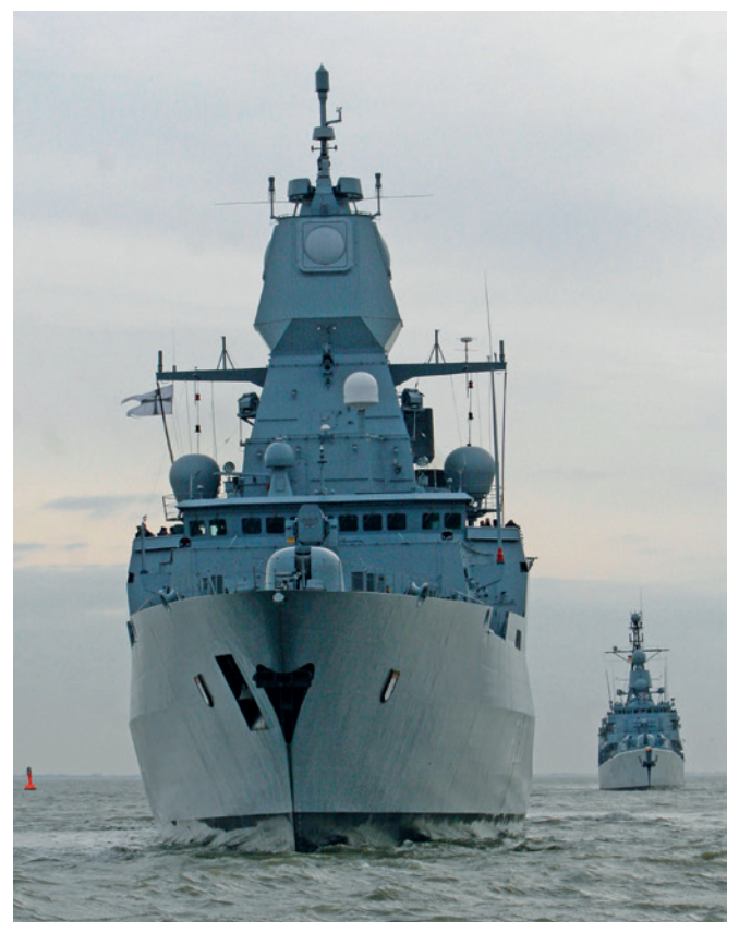
The sale of warships was the starting point for a major corruption case: the 'Frigate Affair'.